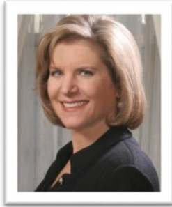
Susan C. Schwab (Chair, 2000 – 2005. )

Dean, School of Public Policy, University of Maryland; former Ambassador and U.S. Trade Representative; Presidents Principal Trade Advisor; Director Corporate Development- Motorola