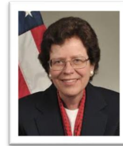
Rebecca M. Blank (Chair, 2006 - 2007)

Dean, School of Public Policy, University of Maryland; former Ambassador and U.S. Trade Representative; Presidents Principal Trade Advisor; Director Corporate Development- Motorola